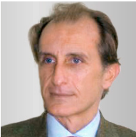
Prof. Vincenzo Stanghellini, Bologna, Italy

Introduction: Functional dyspepsia (FD) and irritable bowel syndrome (IBS): Complex disorders with complex treatments