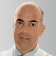
Prof. Fermín Mearin, Barcelona, Spain

Introduction: Functional dyspepsia (FD) and irritable bowel syndrome (IBS): Complex disorders with complex treatments